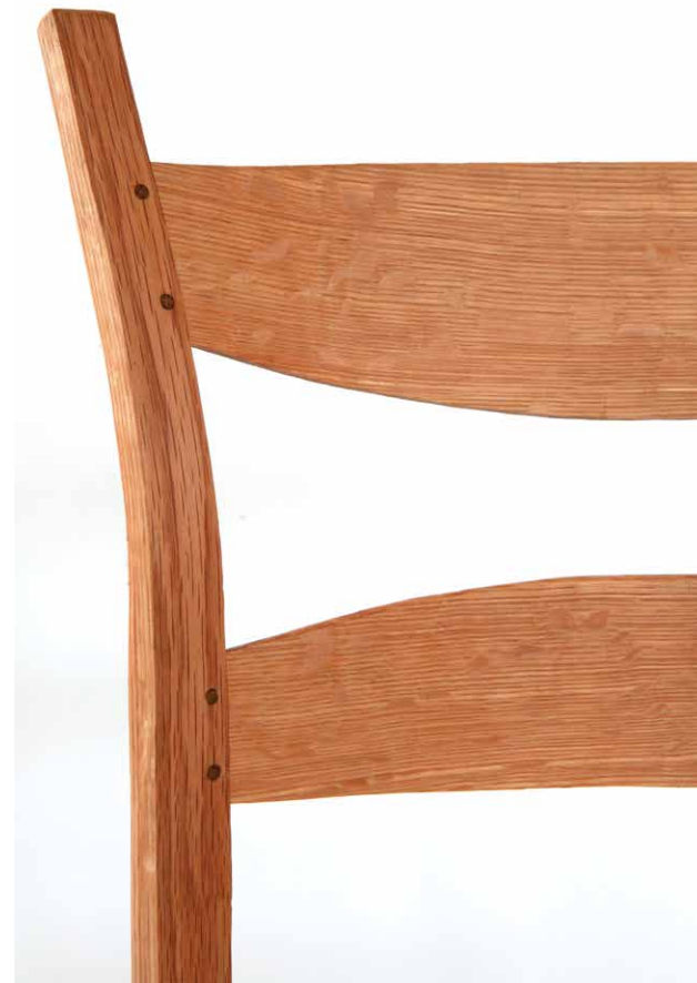
Detail of slats/post. The flat, or relief, shaved on the rear post makes it easier to bend and more comfortable for the sitter than a fully-round post.

At first, my slat backs were too heavy with hickory and big parts. I asked, can we lighten it up? Can we make it like a kitchen chair? Because that is a masterpiece. The mule ear is important to get the roundness of the post out of the way, and it looks good. I also asked: How many rungs and where are they? The wonderful kitchen chair I own is missing one rung compared to mine. Many, or even most,