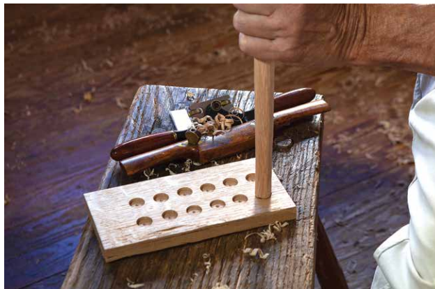
Testing the end of the tenon in the test hole. The resulting bur-nished end gives you a target to shave down to.

One method to form the slightly oversized tenons involves no additional measurement tools. I have used it successfully for many years and taught this method in my classes. At first it may seem complex. However, it regularly produces successful tenons.