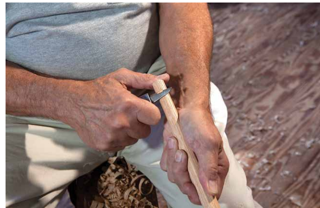
Slicing off the radial side of the tenon. Keep your thumb back out of the way as you pull the knife upward.

Using a knife, lightly chamfer the tenon end. Now place your tenon test plate on your bench, place the rung tenon directly over the first test hole and rotate the rung. Usually the tenon will not fit into the test hole, but the rotation will leave a shiny embossed mark on the end. This will be your guide as you continue shaving the tenon. Skew the spoke-shave and take light shavings. Check your progress frequently. When you think you have reached the edge of the embossed area, test again. If you can just barely force the tenon into the test hole you are done.