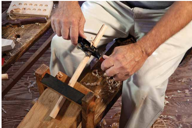
Shaving the rungs is much like what you did on the posts. Same idea, different scale.

Re-draw the central ray plane line on both rung transverse surfaces. The ray plane lines are crucial at each step until they vanish into their mortises.