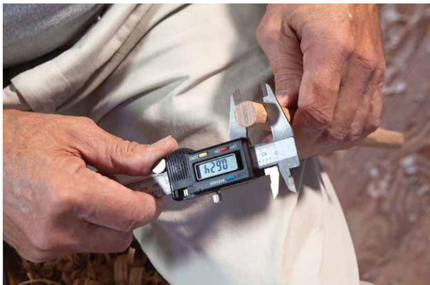
Measuring the tenon diameter with the digital calipers. The flats on the radial sides of the tenon are undersized to reduce the chance of splitting the post.

Begin shaving the tenon with small, regular shavings, rotating the rung "by the numbers," using the mark you placed on the tenon end to gauge your progress. Take an extra shaving on the high points. Once around then check with the calipers. Rung too fat? Go around another time. Too slender? Discard, clearly mark it defective, put it back in the kiln and save it for pegs. Take a substitute from the kiln, make it cylindrical and continue. Use your caliper frequently. Be critical. This diameter is no joking matter. Shave a tenon that is "just right." This is