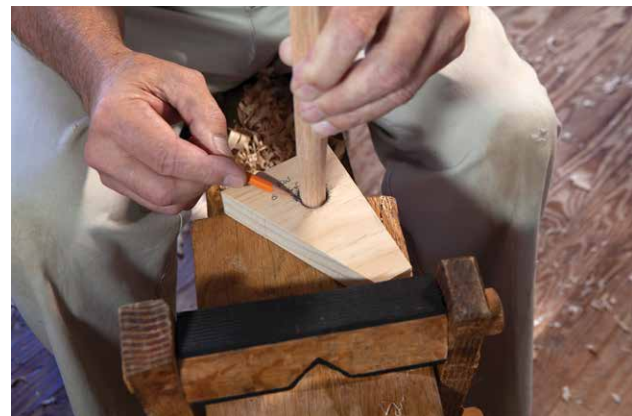
Marking tenon length in a test hole.

A key to the success of this chair is the interaction of the still-moist post and the bone-dry tenon when the chair is assembled. The rung will be oriented in the post with its radial plane vertical and in line with the post's vertical direction. The rung's growth-ring plane will be aligned partially with both the growth-ring plane and the ray plane of the post, depending on the orientation of the post. There will be movement in both the post MORTISE and the rung TENON as they gradually reach EMC and