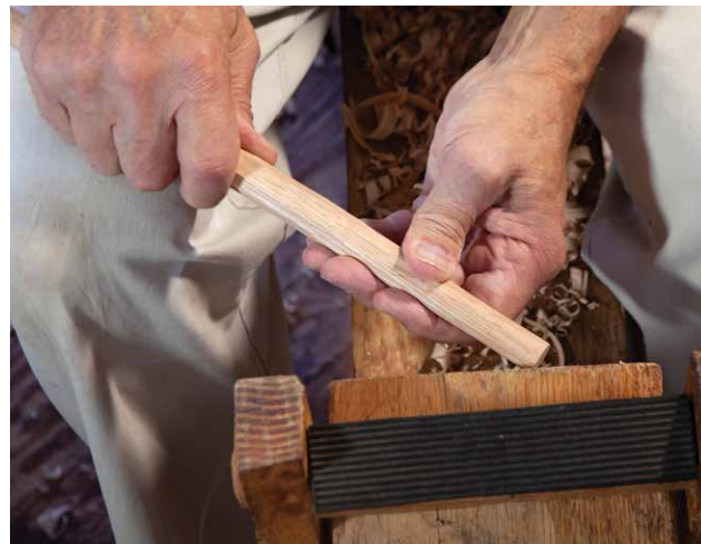
Microchamfer on the shavehorse.