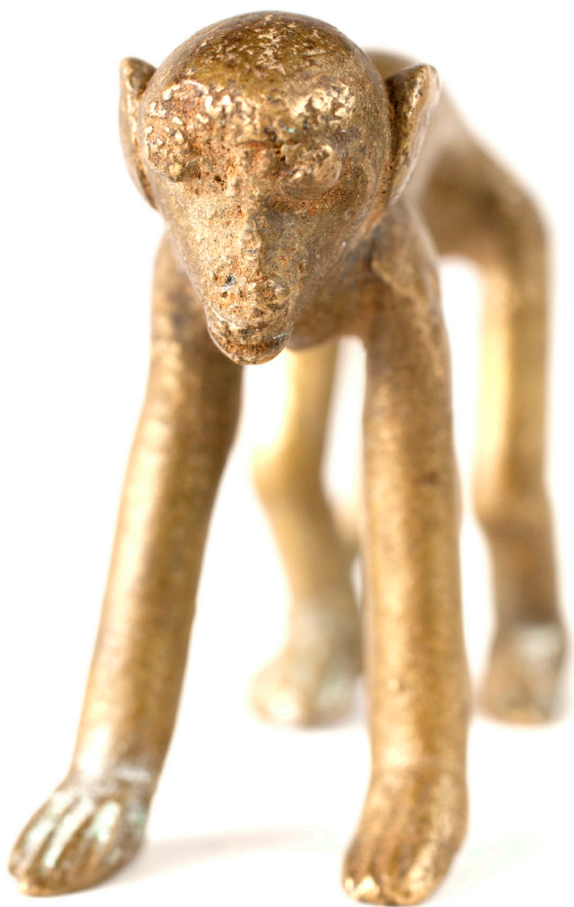
Fig. 1. Brass monkey.